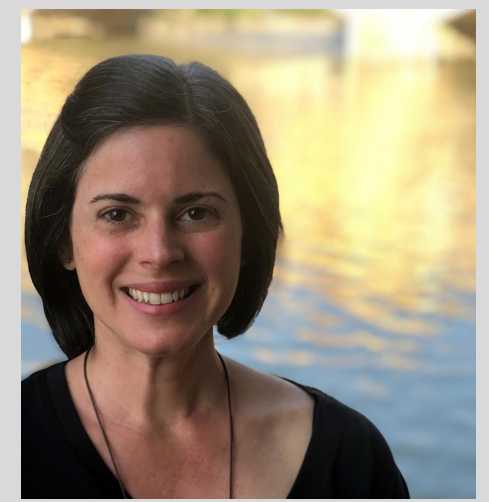
Architect, Founder, and Principal, Verso LLC