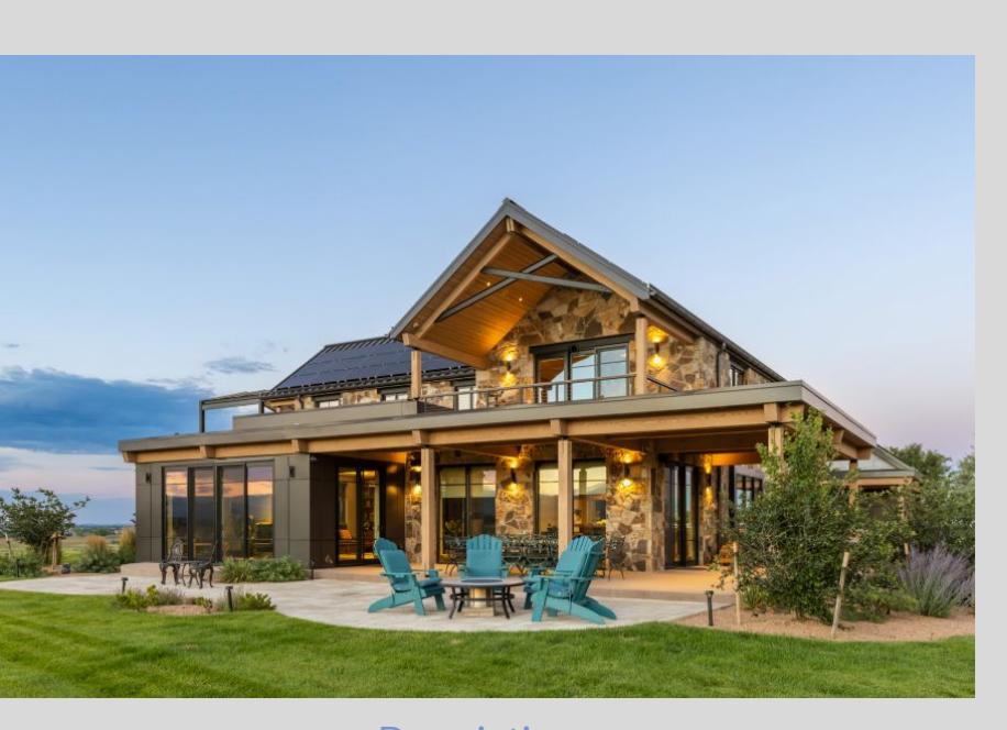
Description Team Info

Aside from its beautiful limestone, metal, and stone exterior, what lies beneath is what is most intriguing. A sustainability plan designed to go below net zero and perform at an incredibly high rate. Working with the National Renewable Energy Lab (NREL), CSU Energy Institute, and The Rocky Mountain Institute, our team was able to derive a state-of-the-art sustainability system that ultimately resulted in a LEED Gold Certification. These green practices include ground source heat pumps, a grey water system, solar panels, onsite energy storage, and a perimeter green roof just to name a few. To maintain a healthy home for its occupants, the team added a whole house water filter system, indoor air quality system, and used environmentally friendly finishes and materials to reduce emissions.